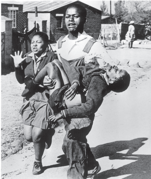
Image from the June 16 th Soweto Uprising in South Africa.

In 2004, the movie, The Day After Tomorrow , showed a world where global warming had somehow plunged the entire world into the ice age overnight. Depicting New York City as a frozen tundra overrun by wolves and all sorts of ridiculous threats. The idea of this movie is nonsensical; however, studies showed the film led moviegoers to have higher levels of concern and worry about global warming. This world presented to us was in no way truthful or realistic, but it certainly did have a positive impact.